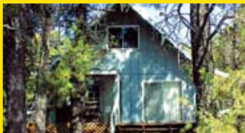
3072 Chevelon Road

Relax on the warm summer evenings on the covered wrap around deck shaded by thick pines. 2 corner lots equaling right around a half acre give plenty of room for your elbows. The cabin is a 1 bedroom plus a good size loft, open kitchen, dining and living room creating a cozy great room. Laundry facilities inside. For the 150's this is a great value even in today's market. Call for your tour now.