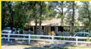
3503 Rae Circle

FUN little get-away for the summer, weekends or even during the ski season! Large 65.5 x 140 foot lot full of alligator and pinon in a decent area. Large master bedroom with walk in closet, full bath and a half bath in the hall. This comes furnished and ready for good times! Home and grounds are in great shape, you won't be disappointed. Call today for some more info and a viewing. $54,900