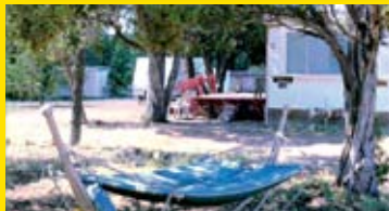
2148 Blue Jay

White Mountains & Rim County - Heber • Overgaard