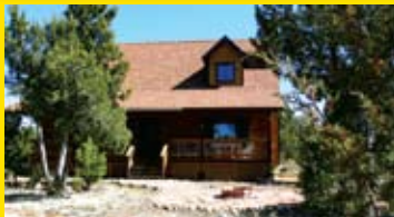
2929 Lookout Lane

this is a newly remodeled mountain cabin on a quiet but huge cul-de-sac lot that flares out in the back and is chain link fenced with privacy slats installed. The cabin is a friendly inclusive place with a central kitchen island that invites the kitchen, living and dining rooms for togetherness. At about 800 square feet, this easy care cabin has laundry facilities, covered front and back decks, and laminate flooring. Gas fireplace/stove to help the wood burning fireplace. At just $119,000 it could be yours with the furnishings! Call now!