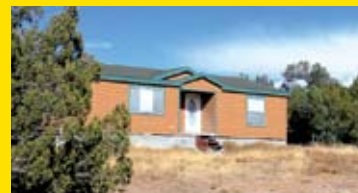
3232 Alkire Drive

2 or 3 acres loaded with tall pines and alligator juniper. The authentic mountain chalet features an enclosed loft, Arizona room takes in the morning sun and can double as an office or foyer. The open floor plan with vaulted ceilings give this place a roomy airy feeling. The utility room is set up for a washer and dryer. Privacy fenced, garden beds and open decking lend to the mountain ambience! Price listed is for 2 acres. This is Real Value! Call on this today! $199,000.