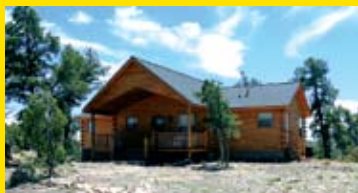
1815 Blue Sky Circle

1,458 square feet of 2 bedrooms, 2 full baths and huge loft over looking the great room and views outside to the east and south. 1 acre of lush pines surround this craftsmanly built cabin in an area of acre lots and site built homes only without any H.O.A.s! Call today! Only $235,000!