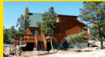
1807 Blue Sky Circle

Custom almost unused home in Forest Trails, an exclusive yet casual subdivision of site built homes only, tall pines and paved roads. This home is a 3 bedroom, 3 bath with a huge loft overlooking the great room. Central heat and air help with the year round comfort during all four seasons. Owner may carry the contract, furnishings, including the pool table, are negotiable. $260,000.