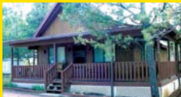
2948 Deer Trail

Built in 2007, this 1,350 square foot home comprises a beautiful open floor plan inclusive of the great room, dining and kitchen additionally the entire flooring is covered with rustic stone looking ceramic tile throughout the home. Built by Century Cedar, this single level log sided cedar home is low maintenance and accompanied with composite decking with hewn log railings. The home is available on one or two acres for you to choose from. $229,000.